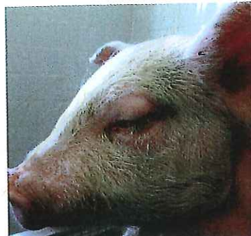
AHVLA investigates oedema disease in weaner pigs, p 168

© British Veterinary Association. ISSN 0042-4900