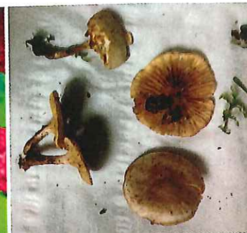
Fungi involved in suspected poisonings of companion animals, p 179