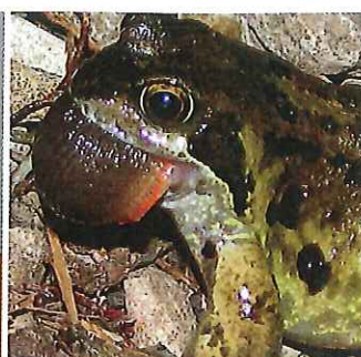
The complex life cycle of Angiostrongylus vasorum , p 116