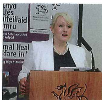
Ministerial launch for a new animal health and welfare framework in Wales, p 107