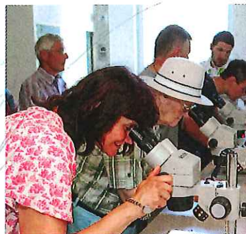
Pirbright Institute offers the public a 'once-in-a-lifetime' tour of its new laboratory, p 133

© British Veterinary Association. ISSN 0042-4900