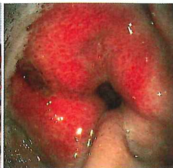
Treating and preventing gastric ulcers in horses, p 145