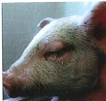
AHVA investigates oedema disease in weaner pigs, p 168