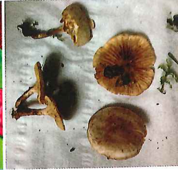
Fungi involved in suspected poisonings of companion animals, p 179