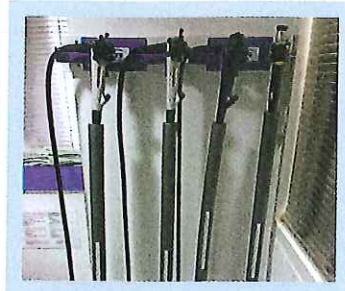
Choosing the right endoscope, p 378

In Practice (ISSN No: 0263/841 X) is published 10 times a year by BMJ Publishing Group and is distributed in the USA by Mercury International Ltd. Periodicals postage paid at Rahway, NJ, and additional mailing offices. POSTMASTER: send address changes to In Practice , Mercury International Ltd, 365 Blair Road, Avenel, NJ 07001, USA.