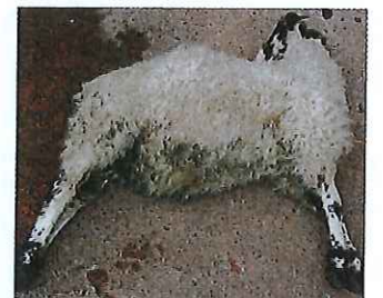
How to investigate sudden death in sheep, p 409