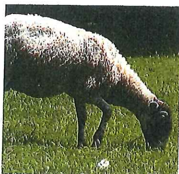
A five-point plan for tackling lameness in sheep, p 225