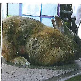
Epidemiological factors associated with gastrointestinal stasis in pet rabbits, p 225