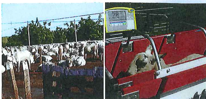
Histophilus somni isolated from Brazilian feedlot steers, p 249