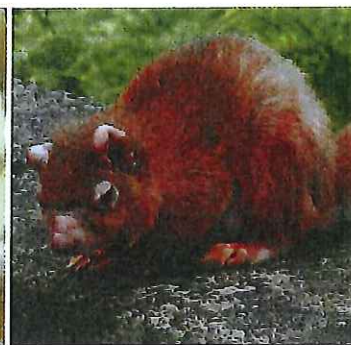
Leprosy in Scottish red squirrels, p 285