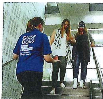
Veterinary nursing students learn what it is like to live with a visual impairment, p 292