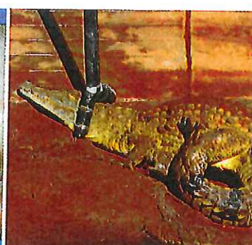
Physiological parameters in crocodiles after capture with electrical stunning, p 304