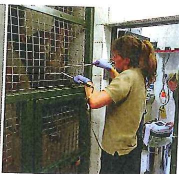
Recording ECGs in conscious chimps, p 341