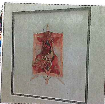
New exhibition celebrates 'One Health, One Art', p 342