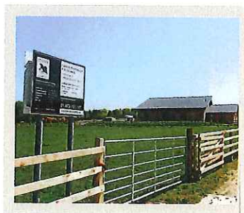
Marketing equine practices, p 475