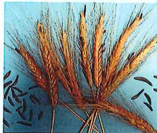
Common plant poisonings in UK livestock, p 455