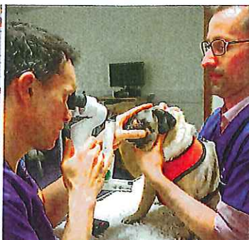
Pugs contribute to ophthalmic research at the RVC, p 393