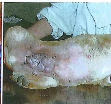
Canine mammary tumours: using serum and tissue prolactin levels to assess prognosis, p 403