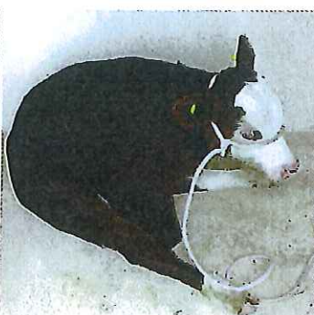
Unusual presentation of Salmonella Dublin infection in calves, p 452