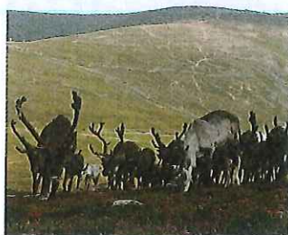
Basic veterinary management of reindeer, p 495

In Practice (ISSN No: 0263/841 X) is published 10 times a year by BMJ Publishing Group and is distributed in the USA by Mercury International Ltd. Periodicals postage paid at Rahway, NJ, and additional mailing offices. POSTMASTER: send address changes to In Practice, Mercury International Ltd, 365 Blair Road, Avenel, NJ 07001, USA.