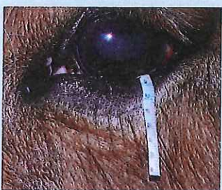
Diagnosing and managing corneal ulcers in horses, p 503