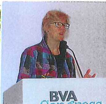
Chief Medical Officer discusses antimicrobial resistance at the BVA Congress, p 522