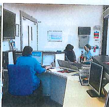
How the vet schools approach communication skills training, p 114