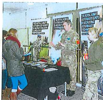
Students explore a variety of career opportunities, p 113