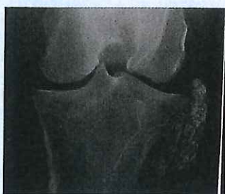
Using radiography to diagnose conditions of the equine stifle, p 77