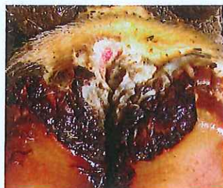
Applying the results of recent research on cattle lameness, p 127