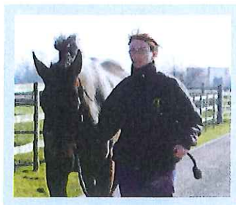
Avoiding pitfalls during equine pre-purchase examinations, p 120

In Practice (ISSN No: 0263/841 X) is published 10 times a year by BMJ Publishing Group and is distributed in the USA by Mercury International Ltd. Periodicals postage paid at Rahway, NJ, and additional mailing offices. POSTMASTER: send address changes to In Practice, Mercury International Ltd, 365 Blair Road, Avenel, NJ 07001, USA.