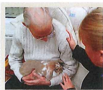
Supporting clients through euthanasia of their pet, p 143