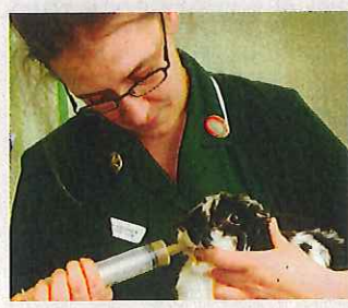
Making the most of veterinary nurses' skills, p 199