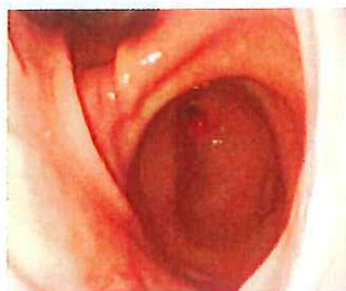
Small animal gastroscopy, p 155

In Practice (ISSN No: 0263/841 X) is published 10 times a year by BMJ Publishing Group and is distributed in the USA by Mercury International Ltd. Periodicals postage paid at Rahway, NJ, and additional mailing offices. POSTMASTER: send address changes to In Practice , Mercury International Ltd, 365 Blair Road, Avenel, NJ 07001, USA.