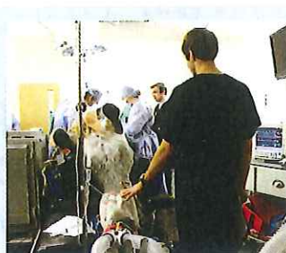
Techniques in intravenous anaesthesia in horses, p 189