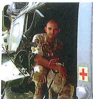
Roles for vets highlighted as part of Army recruitment campaign, p 188