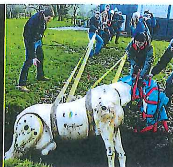
Students get to grips with emergency techniques at the AVS congress, p 190