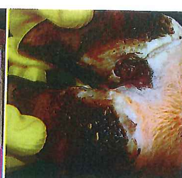
SAC C VS investigates ulcerative, necrotising dermatitis and cellulitis in heifers, p 247