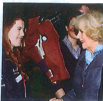
Royal visit to the RVC's Camden campus, p 242