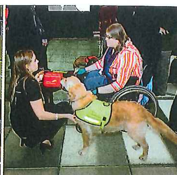
Animals that change people's lives celebrated at European Pet Night, p 275