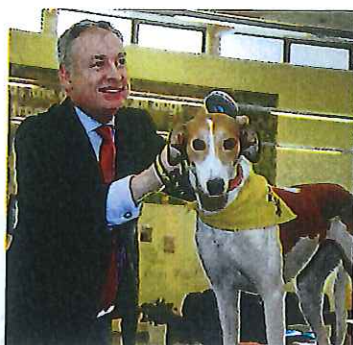
Microchipping of dogs to be made compulsory in Scotland, p 269