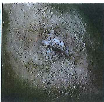
Oedema disease diagnosed in pigs in East Anglia, p 304