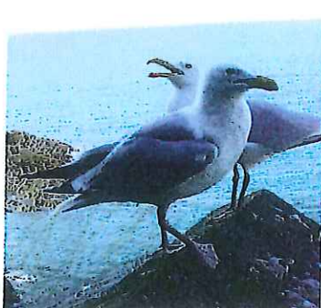
Wild birds identified as the likely source of recent UK avian influenza outbreaks, p 293