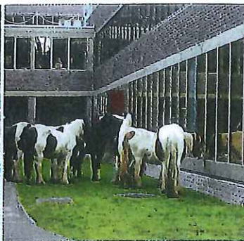
Fly-grazing legislation reaches the statute book, p 320