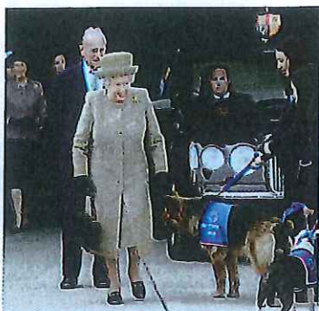
Royal visit to Battersea's new kennels, p 321