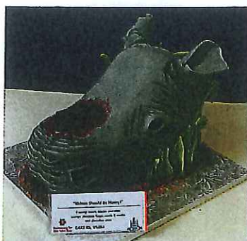
Student cake bake highlights the threat to rhinos, p 377