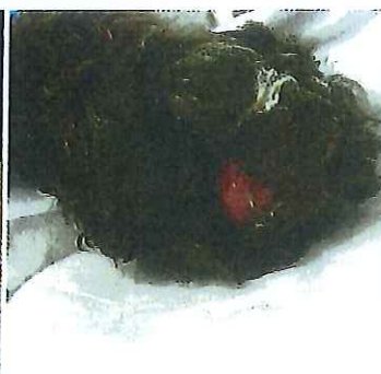
Description of cutaneous and renal glomerular vasculopathy in dogs in the UK, p 384