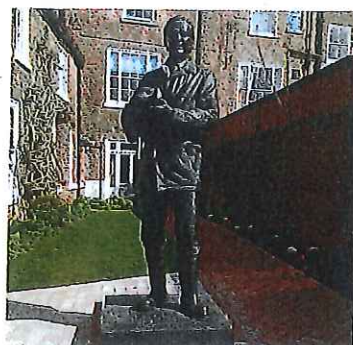
World of James Herriot launches a legacy fund to support future vets, p 426

British Veterinary Association, 042 - 4900