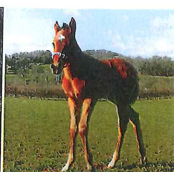
Review of welfare issues in horse breeding, p 436