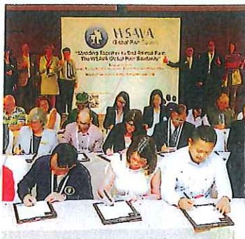
WSAVA member associations endorse global recommendations on animal pain, p 535