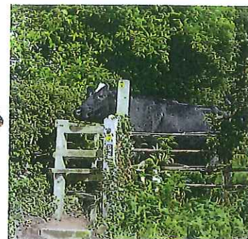
Cattle vets' awareness and understanding of biosecurity, p 546