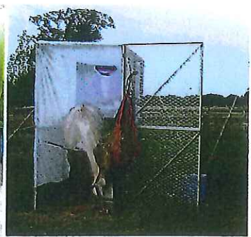
Investigating blood feeding by Culicoides midges on horses, p 574