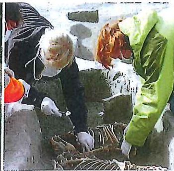
What can zooarchaeology reveal about early veterinary practices? p 564