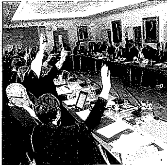
Governance of the RCVS: time for reform? p 588