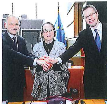
Political agreement reached on new European animal health law, p 609