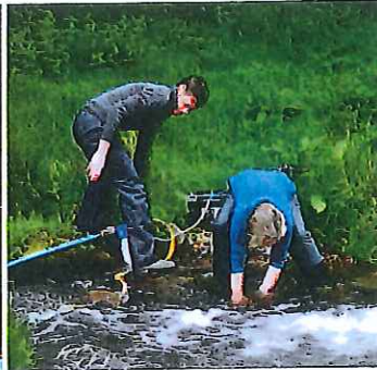
Cryptosporidium in the environment: assessing the contribution of livestock and wildlife, p 615