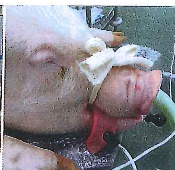
The challenges of anaesthetising pigs, p 96