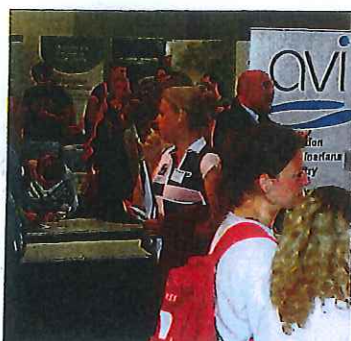
Focus on careers and future wellbeing at seminar for final-year students, p 87