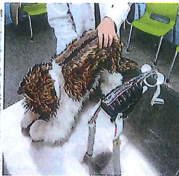
Developing a low-fidelity model to help students learn to palpate the feline abdomen, p 151