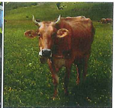
Incidence of uterine torsion in brown Swiss cattle, p 152