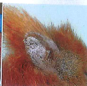
Cases of leprosy identified in squirrels on the Isle of Wight and Brownsea Island, p 206