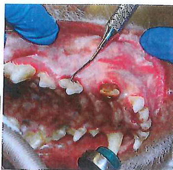
Periodontal disease in dogs: impact of matrix metalloproteinases and their inhibitors, p 201