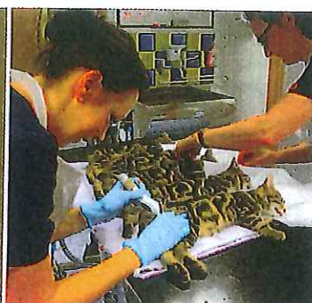
Celebrating veterinary innovation and impact, p 302