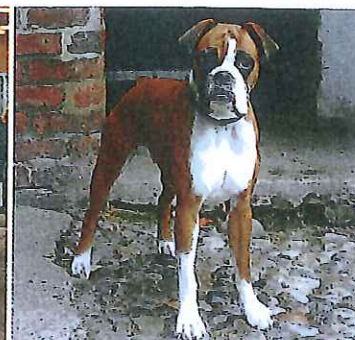
Kidney disease in dogs: incidence and mortality, p 656