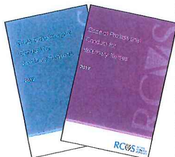
Professional codes of conduct – what do they say, and what do they mean? p 654

© British Veterinary Association. SSN 0042 - 4900