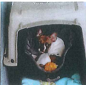
What are the true disease risks from imported dogs? p 670