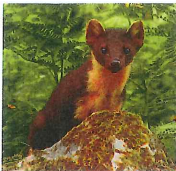
Veterinary charity helps with pine marten recovery project, p 384