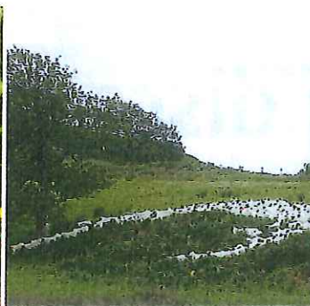
Sheep, and sheep vets, gather on Mull, p 385