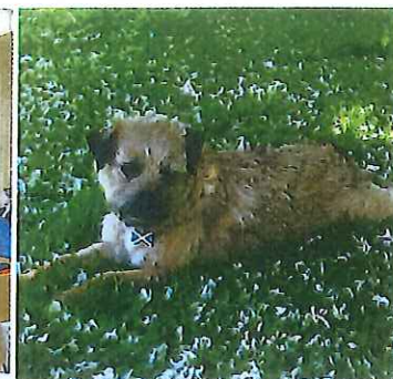
Canine epileptoid cramping syndrome in border terriers, p 498