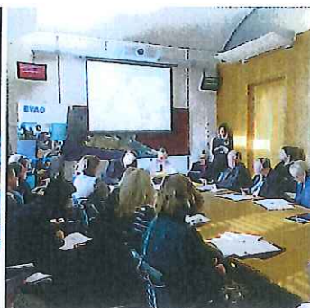
BVA briefs MPs on issues around bovine TB, p 479