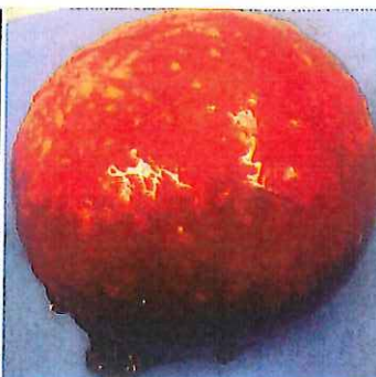
Alveolar echinococcosis in dogs, p 569