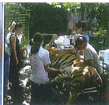
Comparison of protocols for immobilising captive tigers, p 570