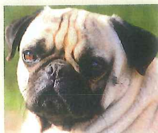
Should your views on brachycephalic dogs affect your clinical practice? p 45