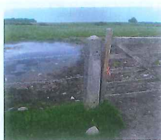
The impact that cattle farming has on climate change, p 10

In Practice (ISSN No. 0263-9141 X) is published 10 times a year by BMJ Publishing Group Ltd, BMA House, Tavistock Square, London WC1H 9JR, UK. The US annual subscription price is $424. Airfreight and mailing in the USA by agent named Worldnet Shipping Inc., 156-15, 146th Avenue, 2nd Floor, Jamaica, NY 11434, USA. Periodicals postage paid at Jamaica NY 11431, US Postmaster: Send address changes to In Practice, Worldnet Shipping Inc., 156-15, 146th Avenue, 2nd Floor, Jamaica, NY 11434, USA. Subscription records are maintained at BMJ Publishing Group Ltd, BMA House, Tavistock Square, London WC1H 9JR, UK. Air Business Ltd is acting as our mailing agent.