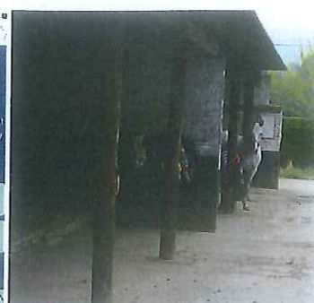
Known and potential vectors of equine arboviruses found on premises in the UK, p 19