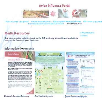
Online portal to provide access to information about avian influenza, p 3