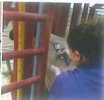
Assessing potential risk factors for injection site lesions in beef cattle, p 70