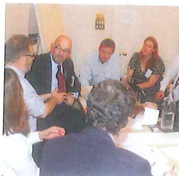
BVA Council discusses ways to build resilient veterinary teams, p 63