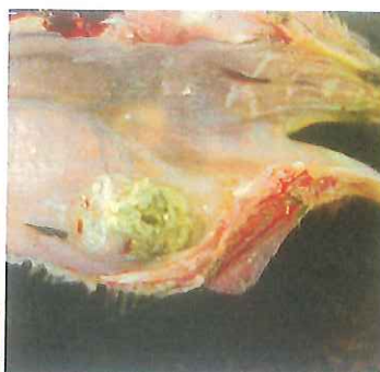
Diphtheritic form of fowl pox in chickens, p 91