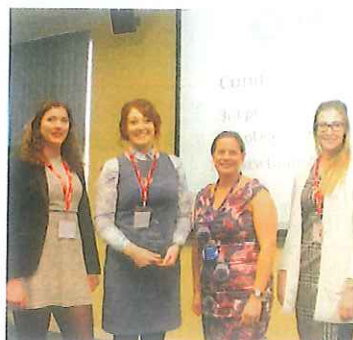
Bursary recipients present their research, p 87