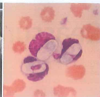
Diagnosis of Hepatozoon canis by blood film examination, p 124