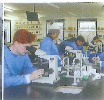
Students gain practical experience at the AVS congress, p 168