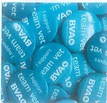
BVA launches 'team vet' campaign, p 164