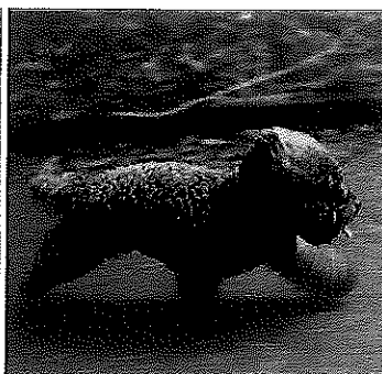
Can exercise be used to treat chronic diarrhoea in sedentary dogs? p 224