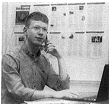
Veterinary Record hosts its first EMS student p 214

British Veterinary Association. SN 0042 — 4900