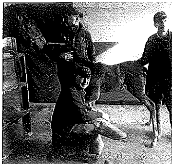
Farrier awarded PhD for foal hoof growth research, p 269