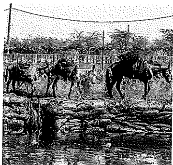
Equine charities team unite to promote global welfare standards, p 292