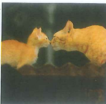
Feline charity invites entries for photography competition, p 345