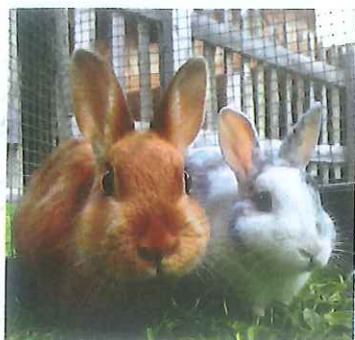
Keeping rabbits responsibly: an Easter campaign, p 343