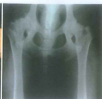
Assessing agreement between scrutineers grading canine hip dysplasia, p 357