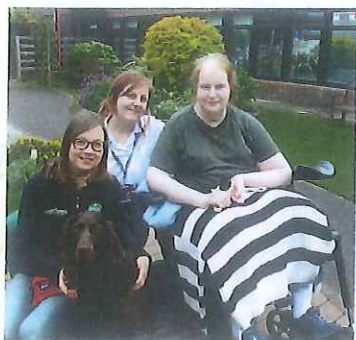
How might therapy dogs help the recovery of patients with spinal injuries? p 415